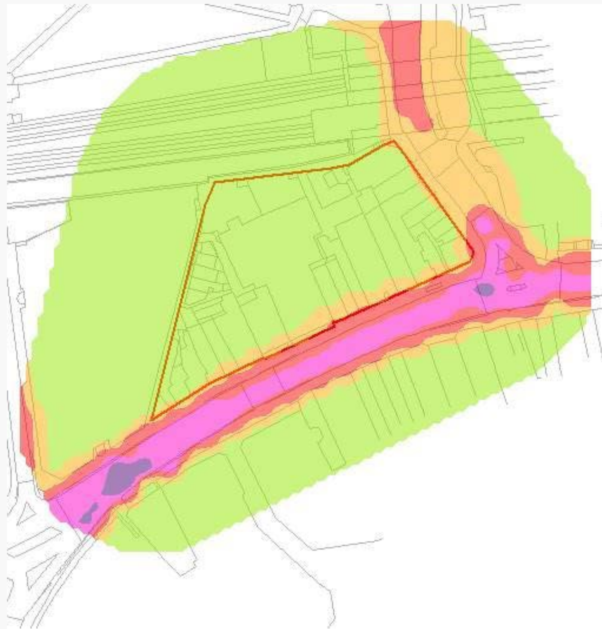
↑ Broadway, Ealing